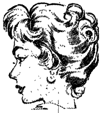
ALICE and DON HAIRDRESSERS 225 West Beaver Avenue