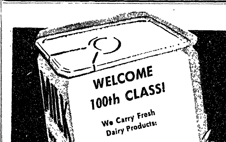
Atherton Si (Route 322) Just Outside State College

The AUTOPORT wishes the BEST OF LUCK to the one hundredth freshmen class of the Pennsylvania State University. The AUTO-PORT has always been the favorite banquet site of Penn State's campus organizations. Aur excellent food and service is always available to you. You can't go wrong if you pick the AUTOPORT!