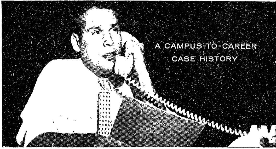
A CAMPUS-TO-CAREER CASE HISTORY

ENROLL NOW for ballroom dancing, tap, toe, or acrobatic lessons. Park Forest Village School of Dance. AD 8-1078.