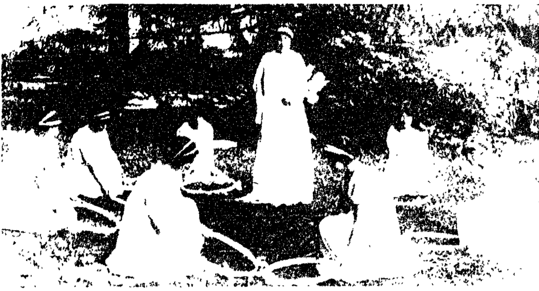
HOOLA HOOPS were even popular in first May Day program in 1914. Queen is surrounded by her court of dancing attendants at the first annual May Day event.