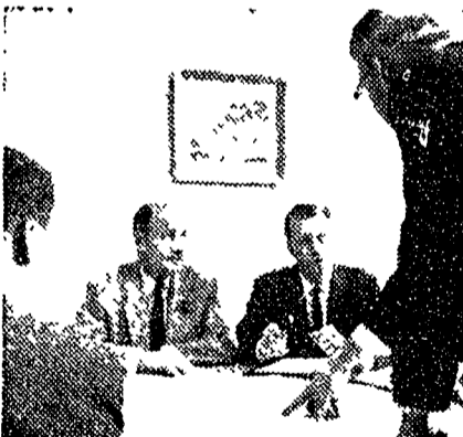
"1:15 P.M. After lunch, I meet with the district department managers to go over floor plans for a central office now under construction. The office is being planned to serve a particularly fast-growing area."