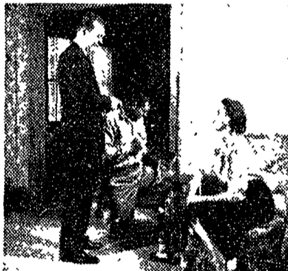
"9:10 A.M. One of the best ways for me to judge the results of our training programs is to ride along with the men on service calls. Here, I chat with a customer while a color telephone is installed in her home."