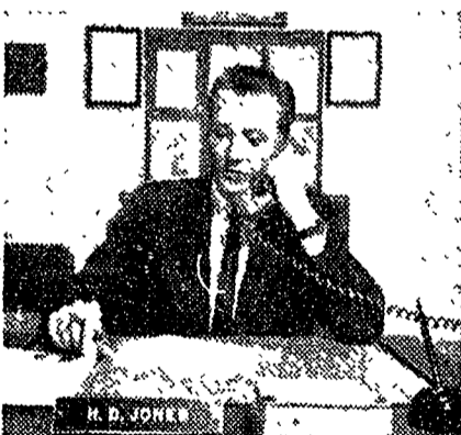
"3 P.M. At my desk I prepare production reports on our installation and repair activities. A foreman reports a complex switchboard installation being completed today. I decide to go over and talk to the customer."