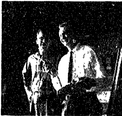
"8 A.M. Today, before the men start out on their job, I talk to the foremen and their crews about the importance of taking every opportunity to sell telephone services and build good customer relations."