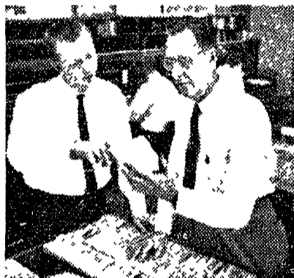
"10:30 A.M. Returning to the office, I check customer trouble reports with my Chief Test Deskman. Continuous study of these reports helps us to prevent serious problems from developing and keep our customers satisfied."