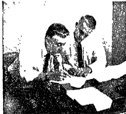
"8:30 a.m. With my test bureau foreman, I plan work schedules for the coming week. Maintaining equitable schedules and being ready for emergencies is imperative for good morale and service."