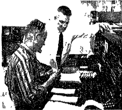
"9:10 a.m. The State Police at Andover have reported trouble with a mobile radio telephone. I discuss it with the test deskman. Naturally, we send a repairman out pronto to take care of it."