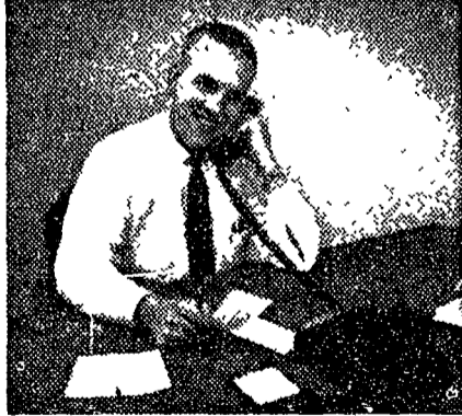
"4:00 p.m. When I get back to my office, I find there are several phone messages to answer. As soon as I get them out of the way, I'll check over tomorrow's work schedule—then call it a day."

"Well, that's my job. You can see there's nothing monotonous about it. I'm responsible for keeping 50,000 subscriber lines over a 260-square-mile area in A-1 operating order. It's a big responsibility—but I love it."