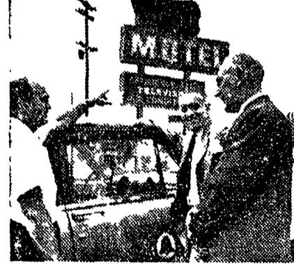
"1:30 p.m. After lunch, I look in on a PBX and room-phone installation at an out-of-town motel. The installation supervisor, foreman and I discuss plans for running cable in from the highway."