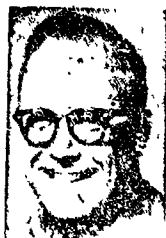
By JIM BATHURST

Our customers get a real lift from our service. We let them ride up on the grease rack.