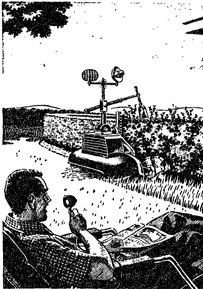
ELECTRICITY MAY DO YOUR YARD WORK. One day, by simply speaking into a microphone, you may be able to command an electric "gardener" to mow the grass, cultivate the flower beds, trim the hedge and do other yard work. And all the while you'll be relaxing in the shade.