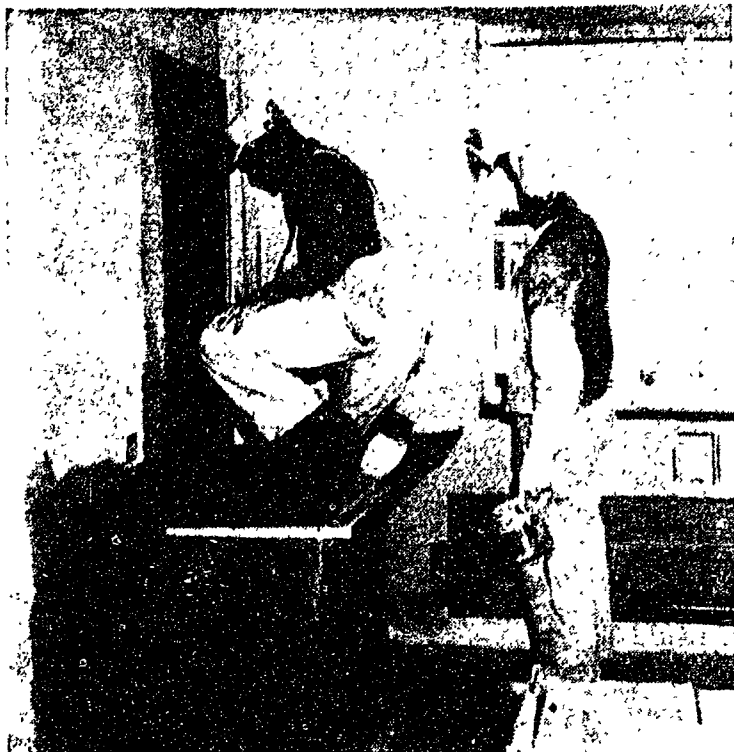
A WAY TO house hundreds of freshmen in an ever-expanding student body—North Halls.