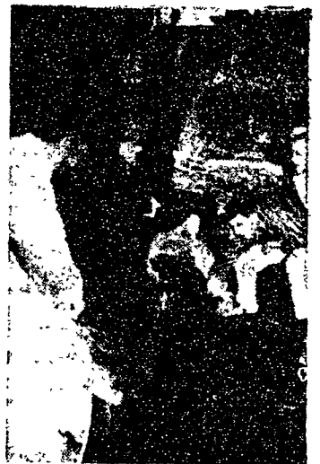
Caught in the act . . .