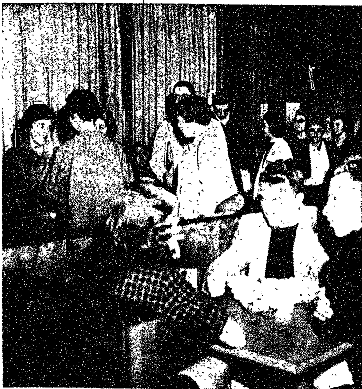
LION'S DEN CROWDS like this are one reason for the proposal to increase "Den" space included in the plans for an expanded Hetzel Union Building.