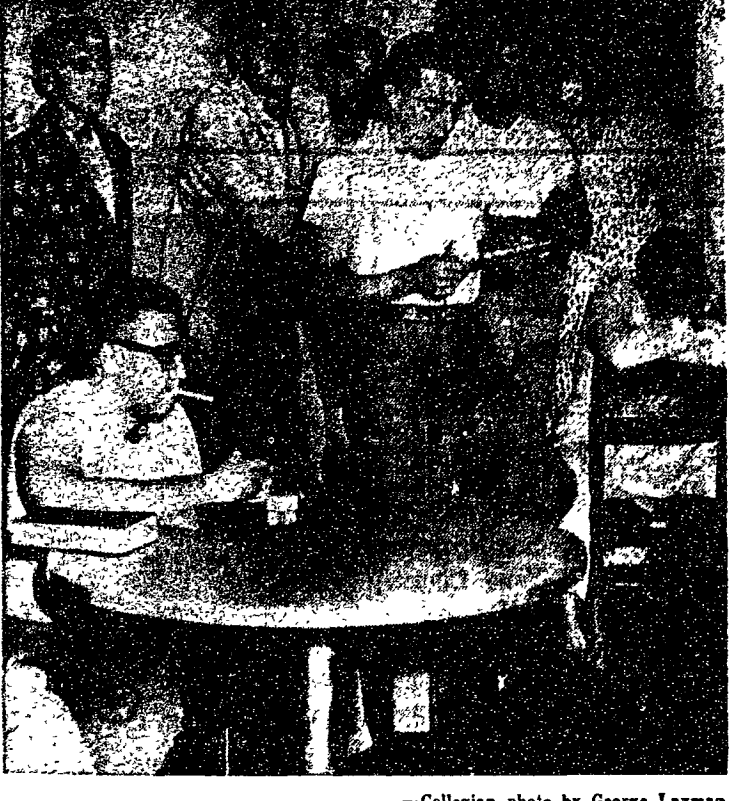
RIGHT-TO-WEAR LEGISLATION is proposed at a Nittany 43 "town meeting" where residents gathered to protest the rule against wearing T-shirts in the dining hall.