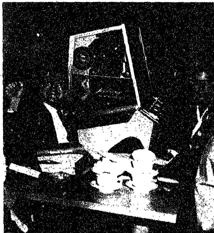
Members of another culture.