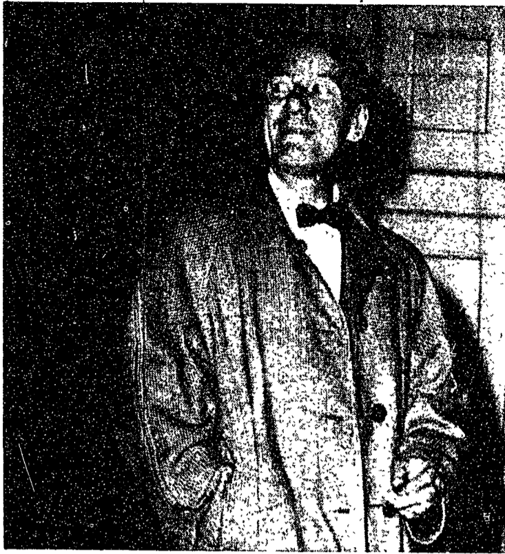
SIR JOHN GIELGUD "Hamlet is my favorite role."