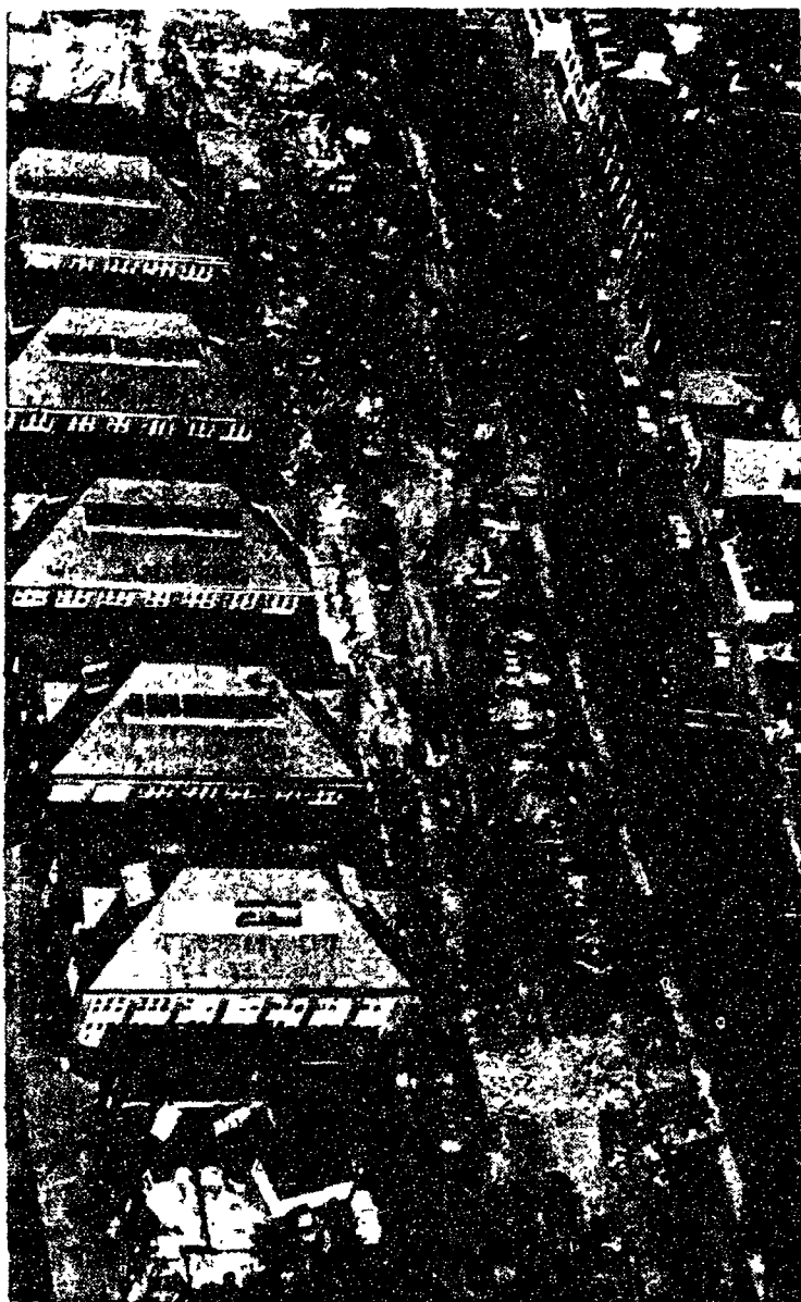
LIKE A BOMBED-OUT RUIN . . . Construction crews level area for the 2-block long Hammond Engineering Building. Giant crane (top center) will run on tracks the entire length of the construction project. "Foxholes" are excavations for the foundation.

Chess Club Will Meet The Chess Club will meet at 7 tonight in 7 Sparks.