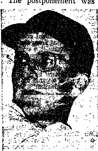
. . . hitting at .328