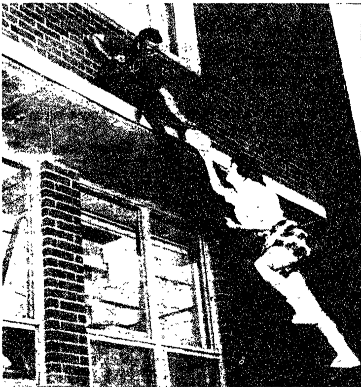
FRISBEE hit the campus early in the spring. Winds played havoc with this couple's game, blowing the disk onto the roof of Redifer Hall.