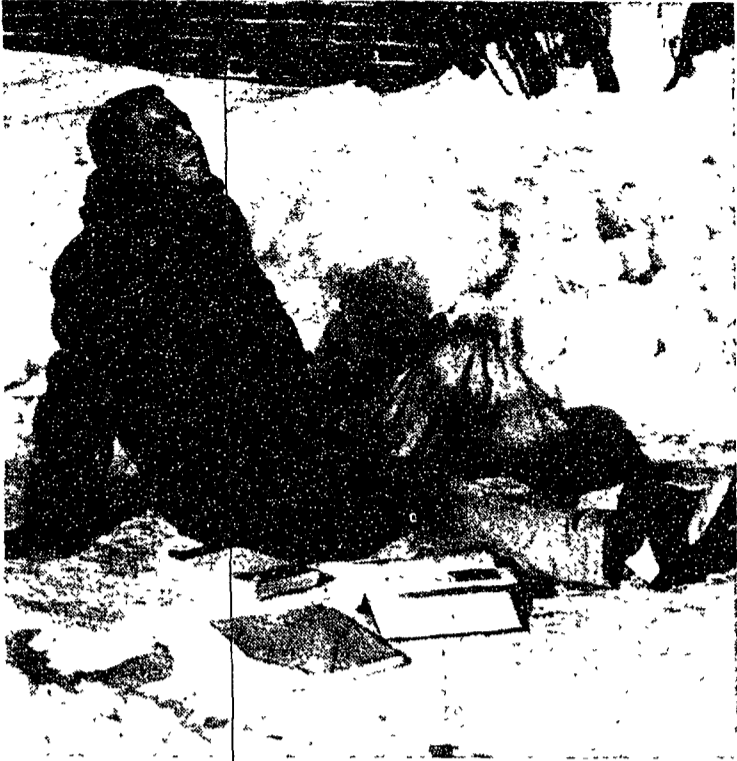
TEMPERATURES in the low teens in February caused many a student to end up in this position. During the second week of February, the mercury never got above the 25 degree mark.