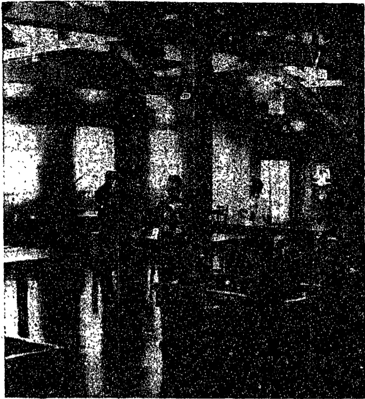
AMONG THE MANY DIVERSIONS at the new Nittany area recreation hall, in the West side of the dining hall, are pool tables, ping-pong tables, and television. The name for the new area is the NUB.