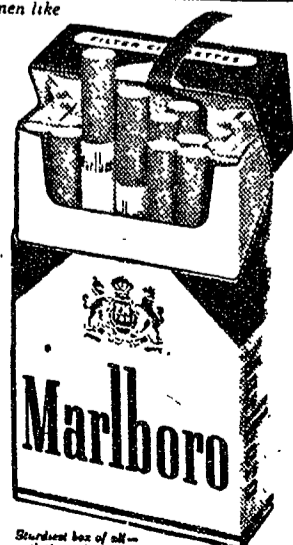
Standard box of all with the exclusive "self-sealer"

YOU GET A LOT TO LIKE—FILTER · FLAVOR · FLIP-TOP BOX