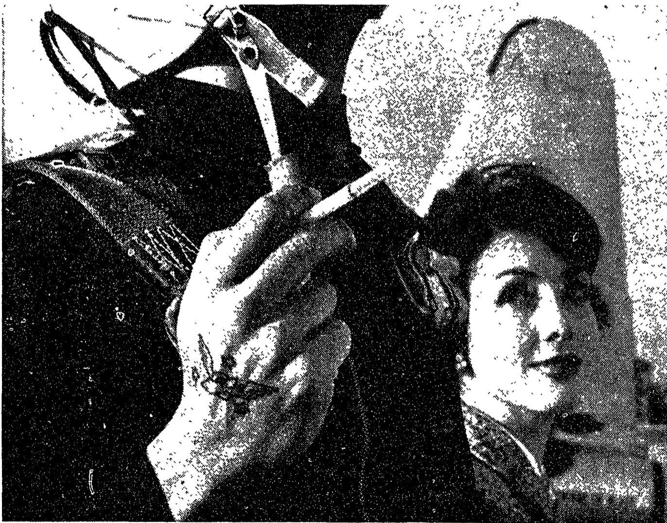
The cigarette designed for men that women like

Mild-smoking Marlboro combines a prized recipe (created in Richmond, Virginia) of the world's great tobaccos with a cellulose acetate filter of consistent dependability. You get big friendly flavor with all the mildness a man could ask for.