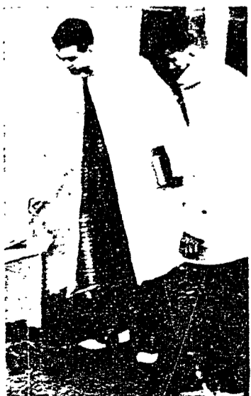
STUDENT PICKS up papers in front of the Collegian office.