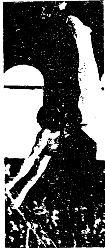
Lee Cunningham ... best of the day