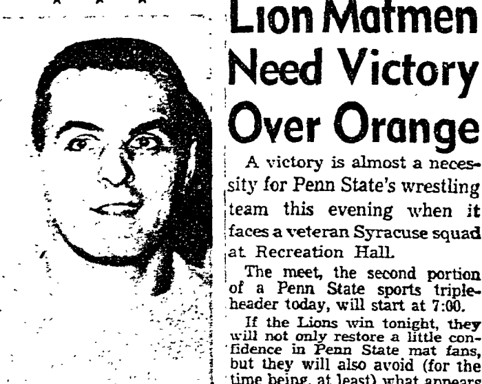
... seeks 1st victory

Lion Matmen Need Victory Over Orange A victory is almost a neces-