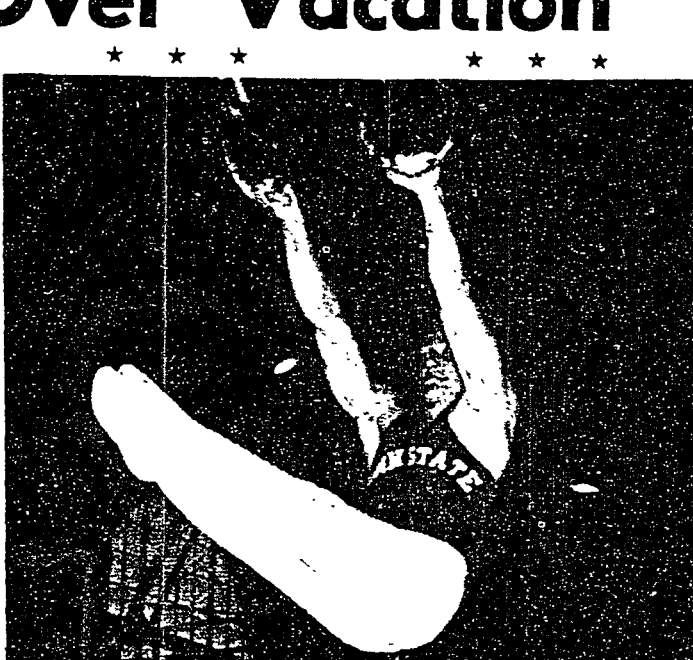
ACE LION FLYER Jay Werner starts swinging into a difficult move in his high-scoring routine on the flying rings. Werner picked up a first with 277 against West Virginia for the highest score of the meet.

ADS MUST BE IN BY 11:00 .... THE PRECEDING DAY RATES-17 words of (essi $0.50 One insertion $0.75 Two insertions $1.00 Three insertions Additional words S for .05 for each day of insertion. RATES-