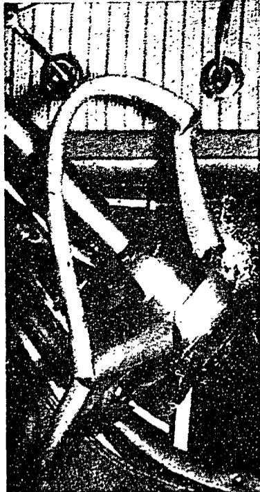
administration from Altoona was seriously injured. The steering wheel (right) was pushed to only a few inches from the roof of the auto.