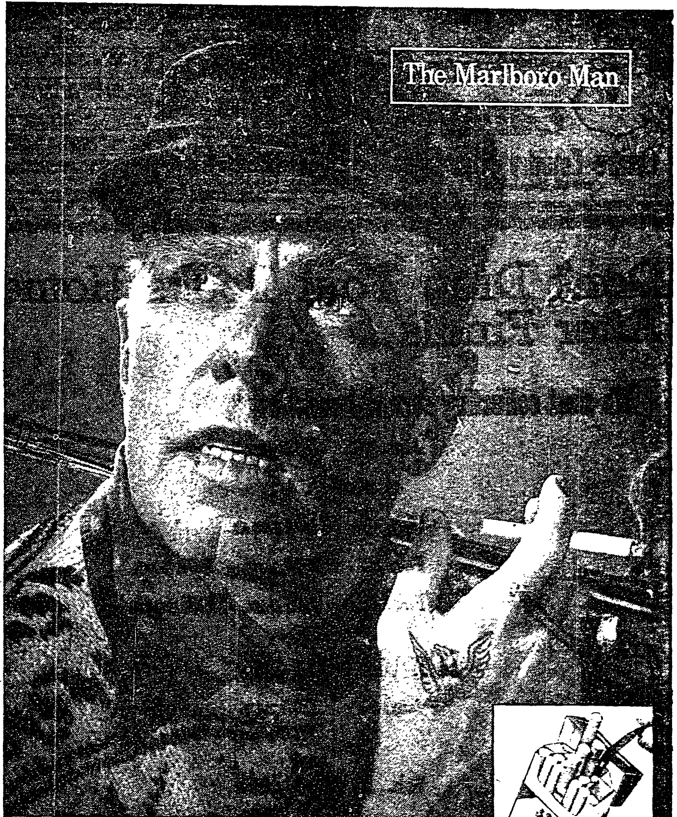
The Marlboro Man