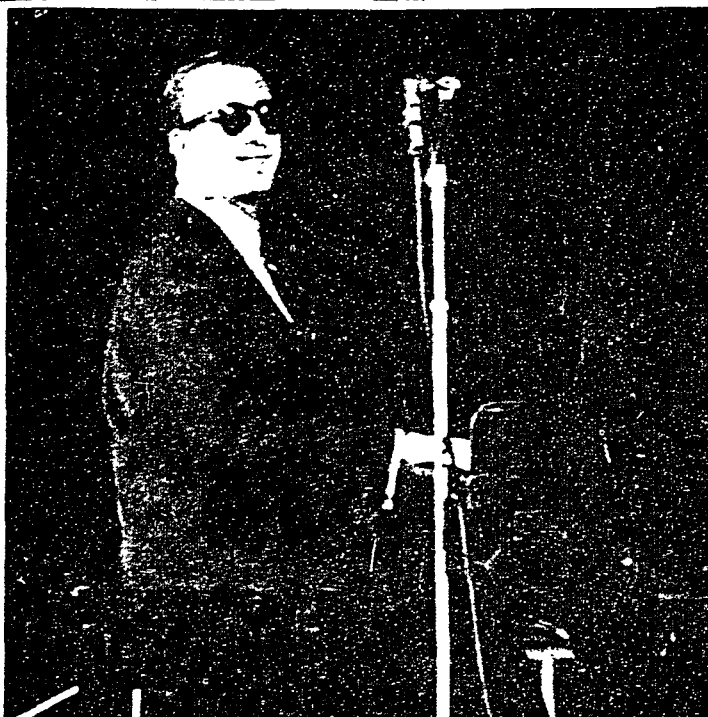
BLIND MUSICIAN George Shearing plays the piano with his quartet in Recreation Hall for jazz fans at Sunday night's concert. Shearing started his concert 45 minutes late because of plane troubles traveling from Fort Worth, Texas.

Foh GOOD RESULTS USE COLLEGIAN CLASSIFIEDS