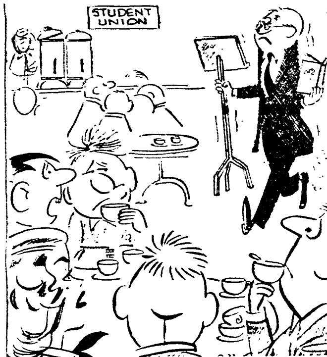
"Oh-oh—guess too many of us 'skipped' today— He followed us over HERE."

Christmas Party FOR Elementary Education Freshmen Tuesday, Dec. 10 7-10 p.m. HUB Dining Rooms A & B FUN, ENTERTAINMENT, REFRESHMENTS