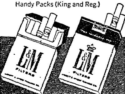
01957 LIGGETT & MYERS TOBACCO CO.