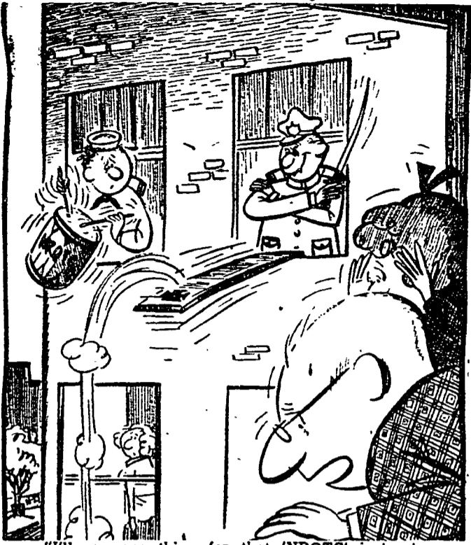
"I'll say one thing for that 'NROTC' instructor—He very seldom has a discipline problem."