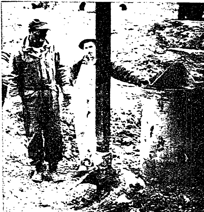
CONSTRUCTION WORK CONTINUES on the new men's dorms as two workmen watch a 50-foot high drilling rig bore foundation holes for pouring concrete.

Women's Student Government Association House of Representatives will meet at noon today in McAllister Hall.