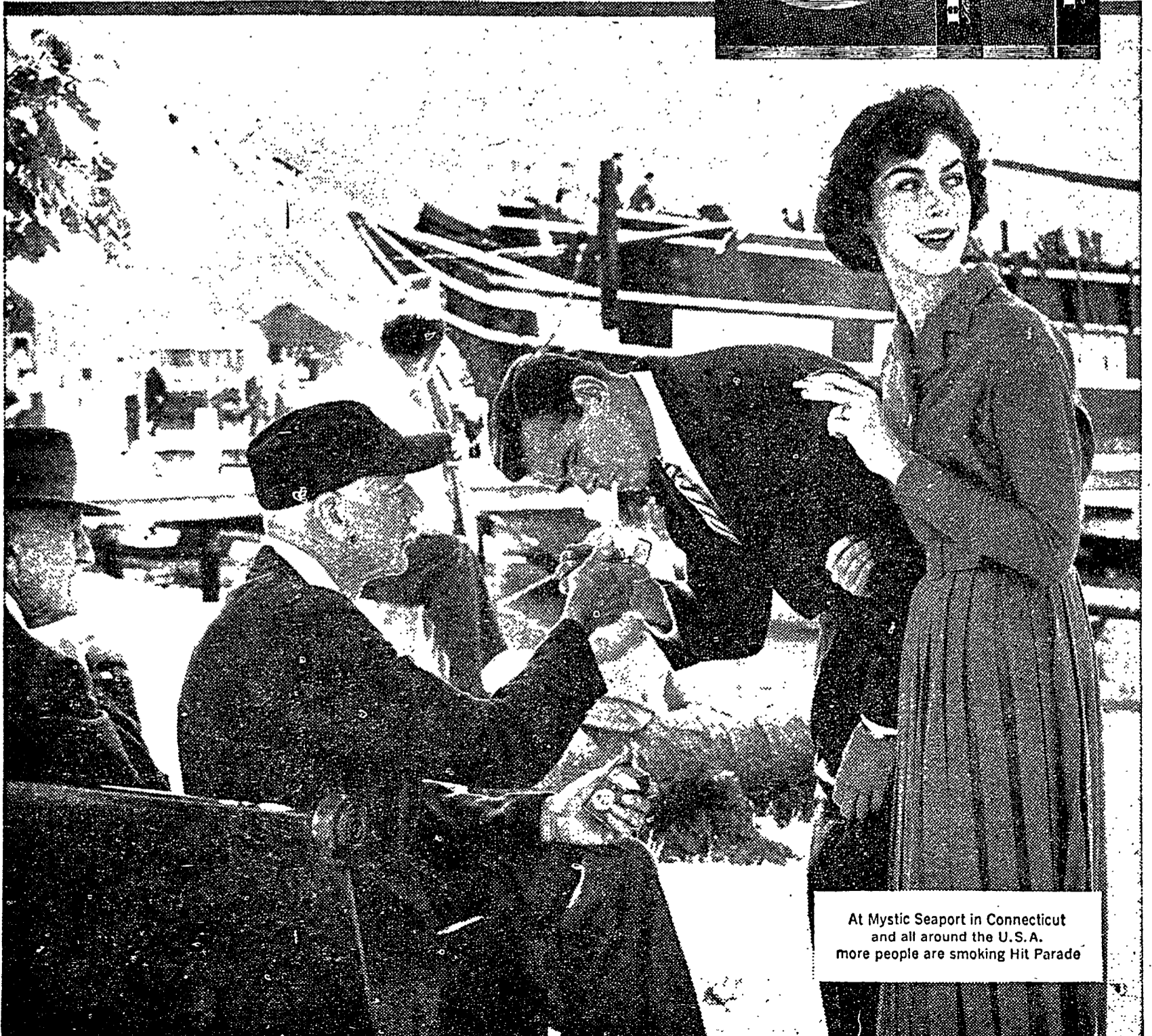
At Mystic Seaport in Connecticut and all around the U.S.A. more people are smoking Hit Parade