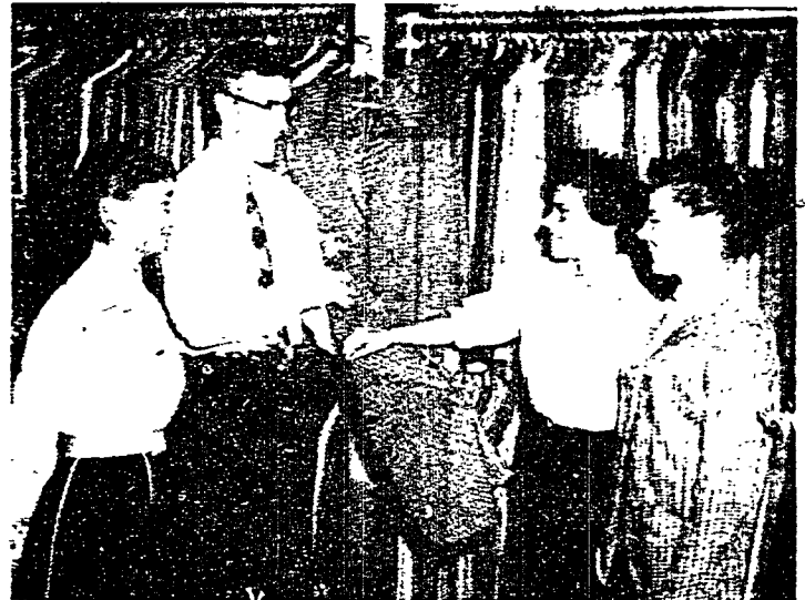
Representatives of Phi Sigma Sigma and Hur's sales force preparing for Hungarian Scholarship Days

Let the girls help serve you in their effort to serve others. Our regular friendly sales people are at your service as well!