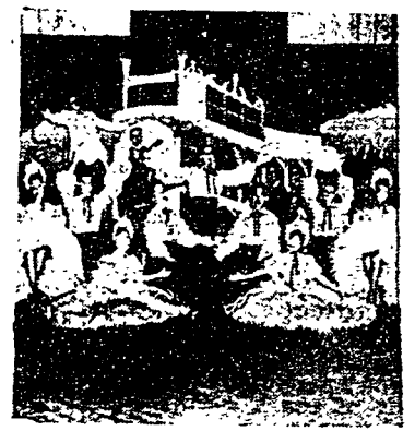
2nd Army Show Boat

Get your tickets now at the Mall or the HUB Desk