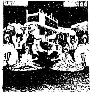
2nd Army Show Boat

Get your tickets now at the Mall or the HUB Desk