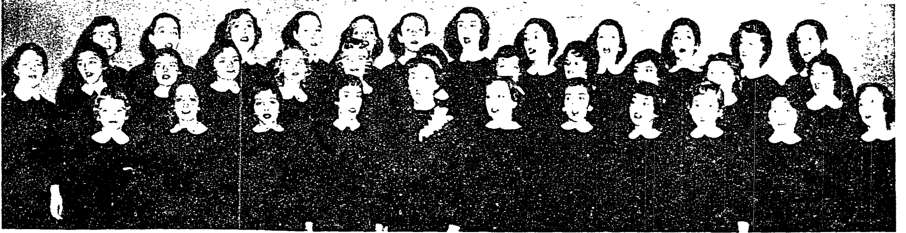
THE VICTORS in the Interfraternity-Panhellenic Sing, Kappa Delta sorority and Tau Kappa Epsilon fraternity.