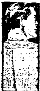
button down collar with just the right slope

Reflecting the selectivity and craftsmanship characteristic of New England's finest shirtmakers. A shirt with the indisputable authority of good taste executed in fine fabrics of Madras or Combed Oxford stripes.