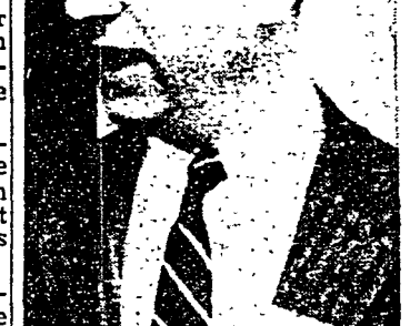
Gov. George M. Leader Career Day Speaker