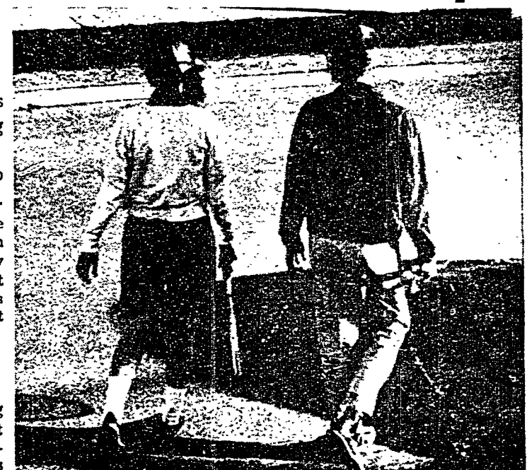
A COED, a guy, two rackets, but no tennis nets!