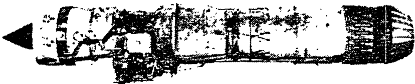
P & W A's J-57 turbojet . . . first engine in aviation history to achieve official power rating in the 10,000-pound-thrust class. Its pace-setting performance blazed the way for this grueling mission that set awesome flight records.