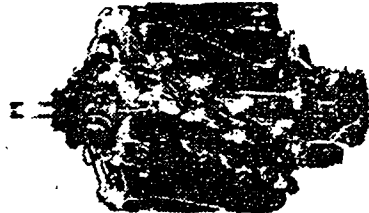
The Wasp Major . . . P & W A's R-4360 whose power (3,800 hp.) and performance have never been equalled in the piston engine field.