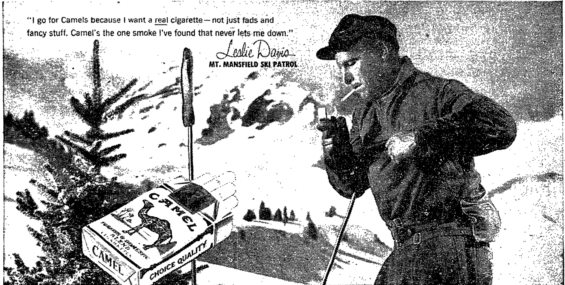
R. J. Reynolds Tobacco Company, Winston-Salem, North Carolina

Discover the difference between "just smoking" and Camels!