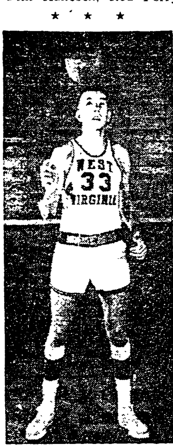
"HOT ROD" HUNDLEY, whom experts say is the number one clown of basketball and one of the best players in the game, will be the man the Lions will have to check tonight at Morgantown.

West Virginia won both games against the Lions last year, 81-79 at Morgantown and 76-73 here.