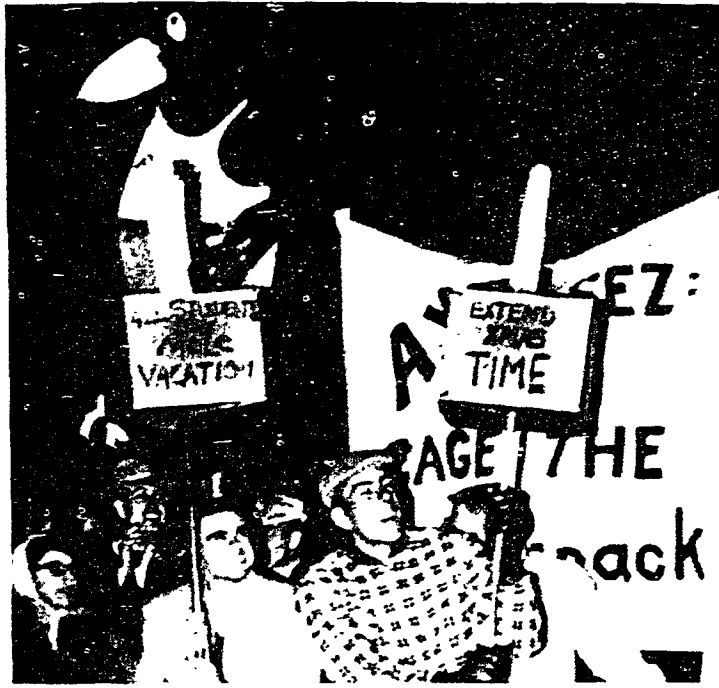
BANNERS ASKING for a longer Christmas recess were waved at the pep rally last night along with typical banners supporting the football team. Two of the banners read "All Students Say More Vacation" and "Extend Xmas Time." (Story on page 1).