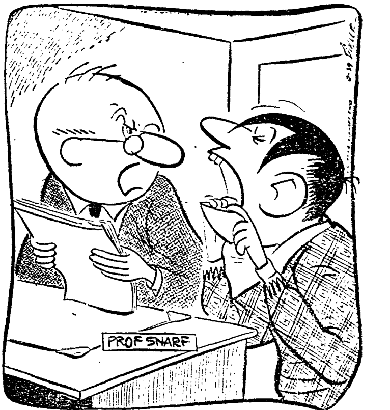
"Oh, come now—you know very well what I mean by an 'ORAL' EXAMINATION."