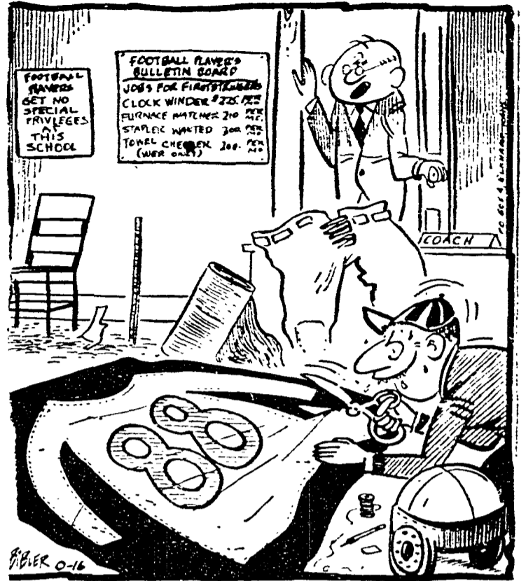
"Hey Coach, what's this I hear about a 'winning prospect' you found for us this season?"

Heart of Mary, this Sunday, the day of the Feast of Christ will be preceded by confession services.