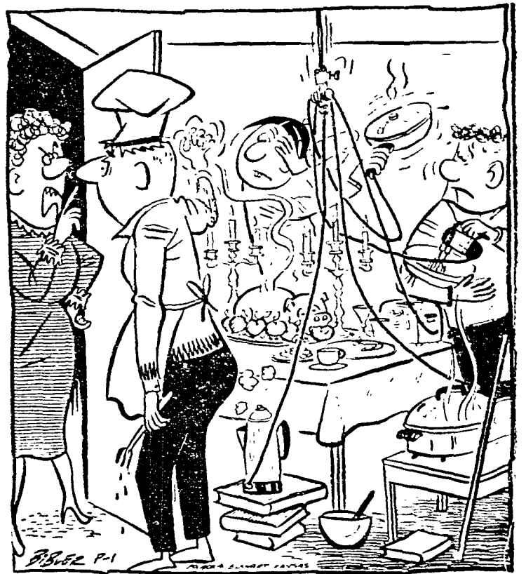
"What smells? You know th' rules about having food in th' rooms."