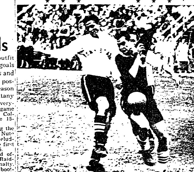
Photo by IT'S A FREE BALL, and two Penn State soccer players are fighting for it with a Colgate booter. The Lions won their third game of the season, defeating the visitors, 5-2. The win puts the Lion record at 3-0-1. The one tie came at the hands of West Chester.