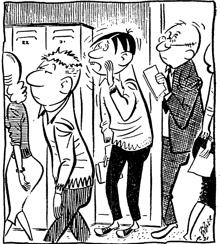
"Phsst — did ole muscle-mouth take roll today?"