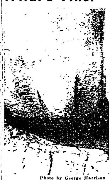
CLUE: A great understanding See answer on page 12.

Today promises to be another warm and humid day, with temperatures rising even higher than