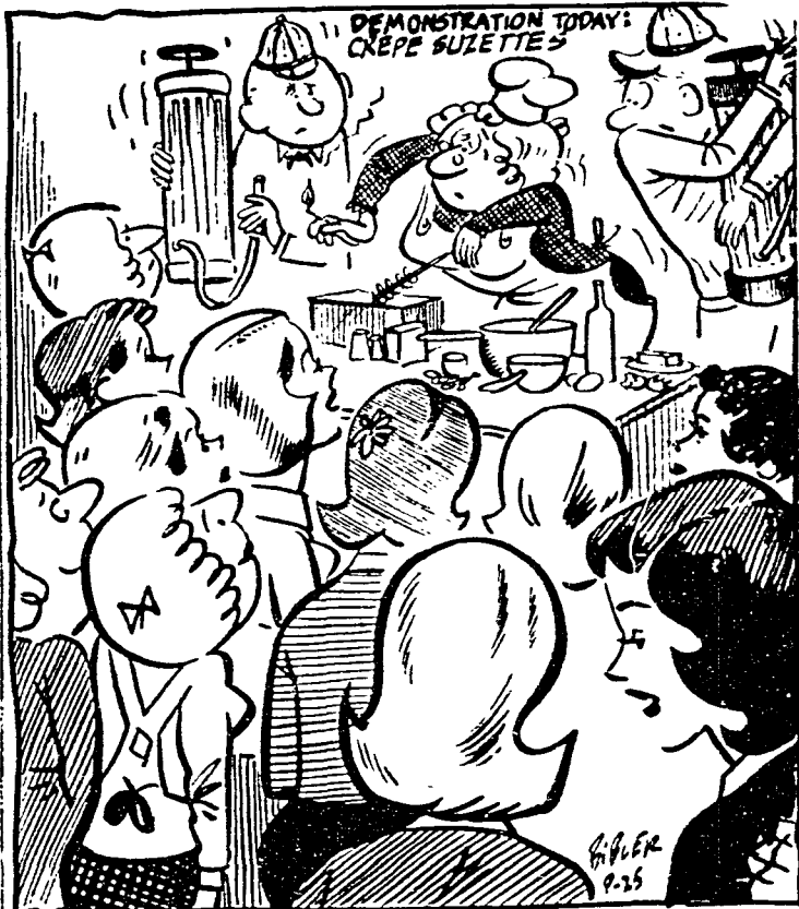
"You should have seen her demonstration LAST year!"