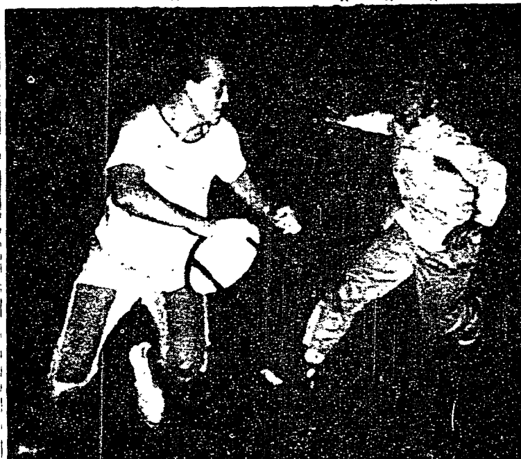
A NEWMANITE BACK looks apprehensively down field as he decides whether to pass or run with the ball in IM football action last night on the New Beaver Field practice turf. All was in vain, however, as the Alleycats edged the Newmanites, 7-6.

With one minute remaining in regulation time, Lepitsky lateraled to Chuck Agnew, who ran 70 yards to the Co-ops 10 yard line. But a penalty for having only four men on the line nullified the play.