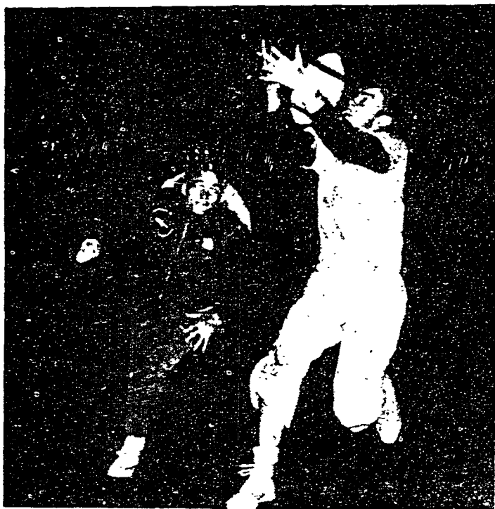
ALPHA ZETA player snares a pass, while Delta Sigma Phi defender tries in vain to tag him.

passer, had poor luck all night and couldn't get the required yardage for a first down, although he completed a number of short ones.