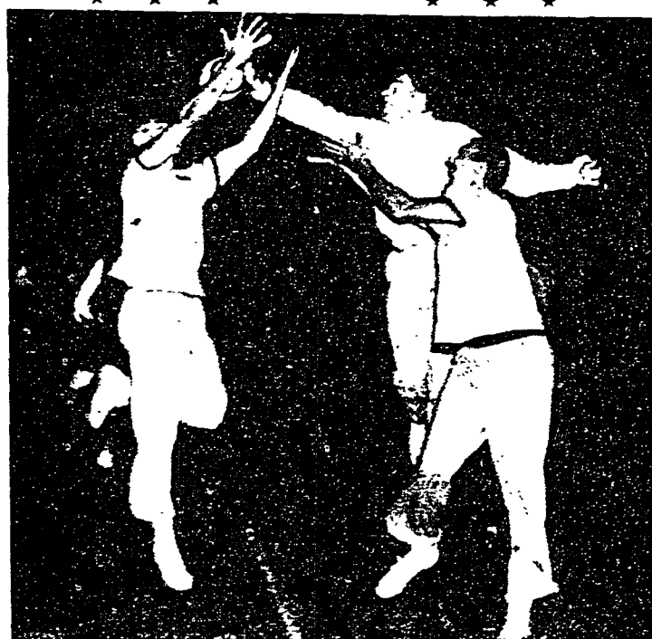
AN ACACIA pass defender smashes down an attempted Phi Kappa Psi pass in IM action last night.